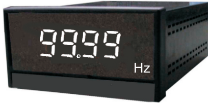
DE - 940F 4 Digits Frequency Meter